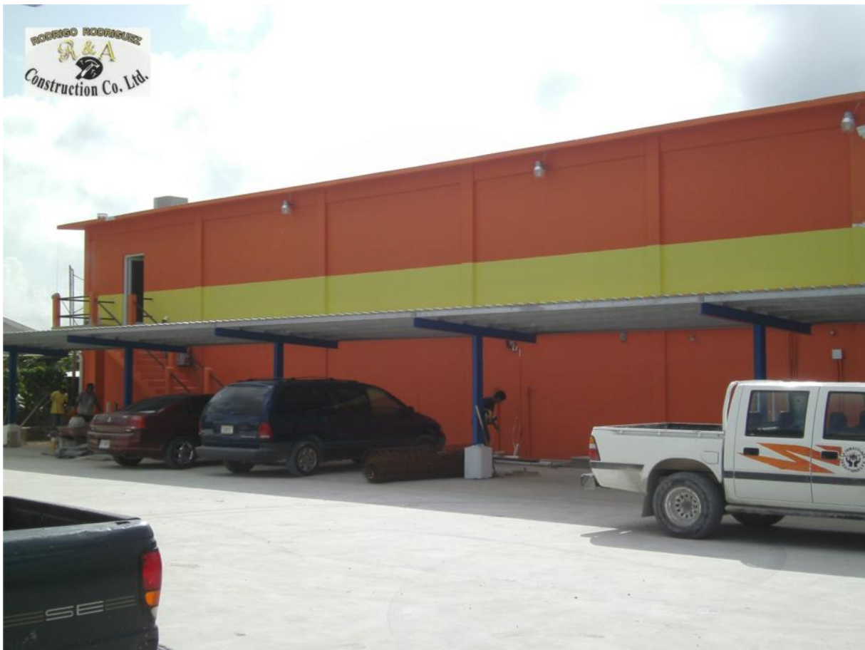
LA INMACULADA CREDIT UNION: SSEDAT PROJECT