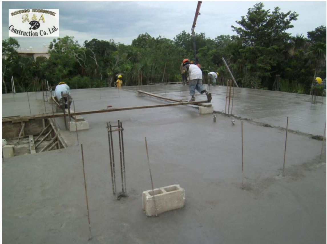
CONCRETE FLOOR CASTING: ORCHID BAY, CHUNOX, COROZAL DISTRICT