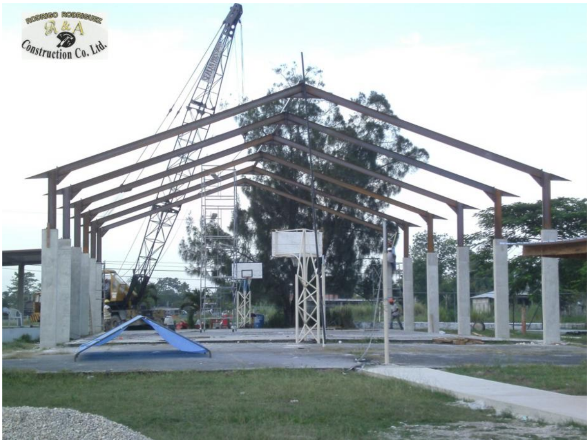
METAL FRAME SHED FOR ORANGE WALK TECHNICAL HIGH SCHOOL