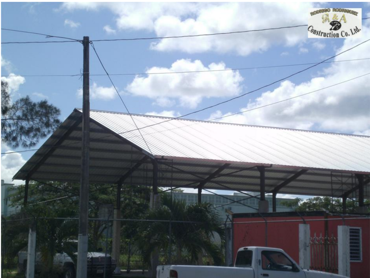
METAL FRAME SHED FOR ORANGE WALK TECHNICAL HIGH SCHOOL